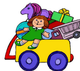
Toys for Care Lodge